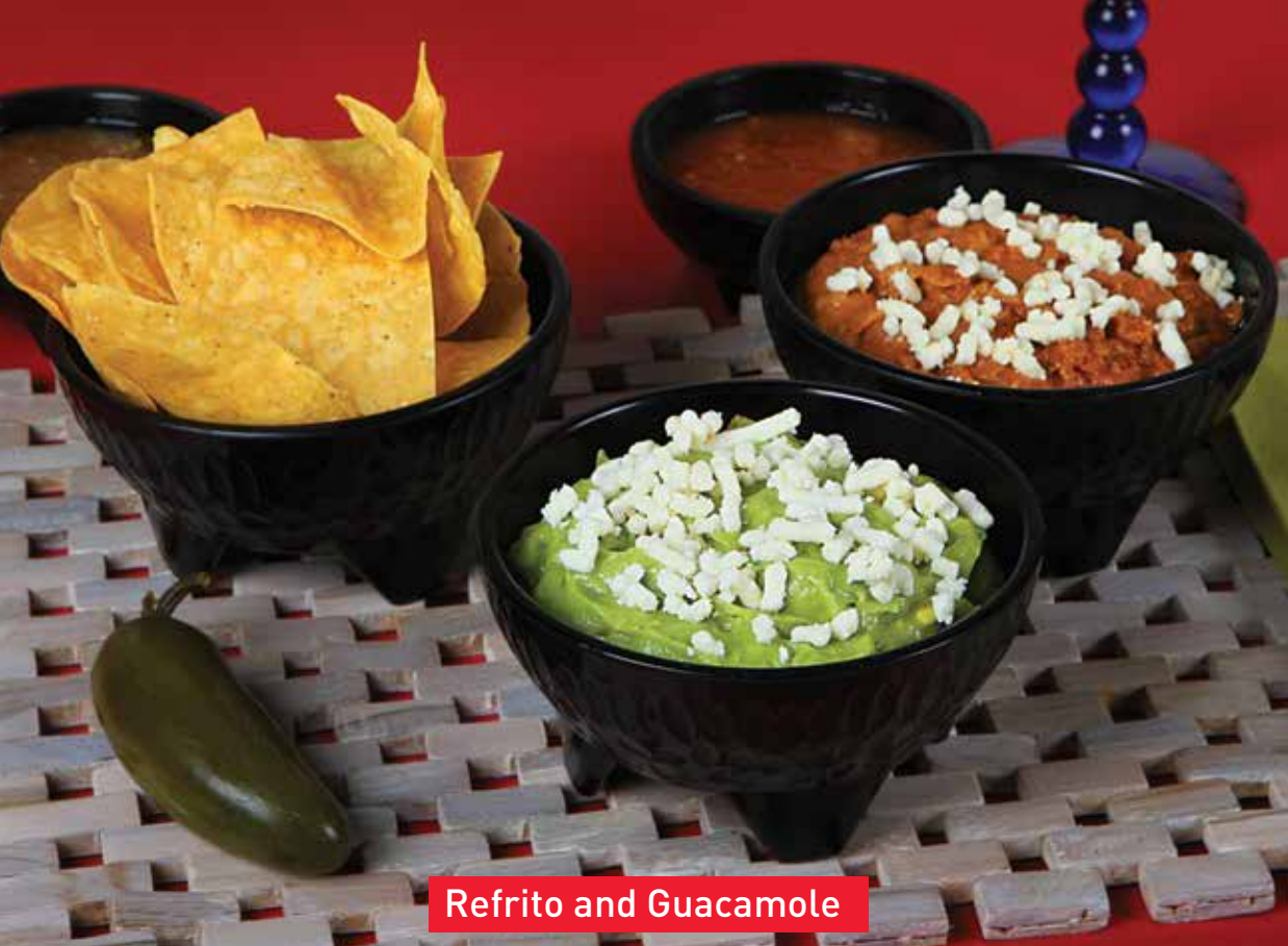
Refrito and Guacamole