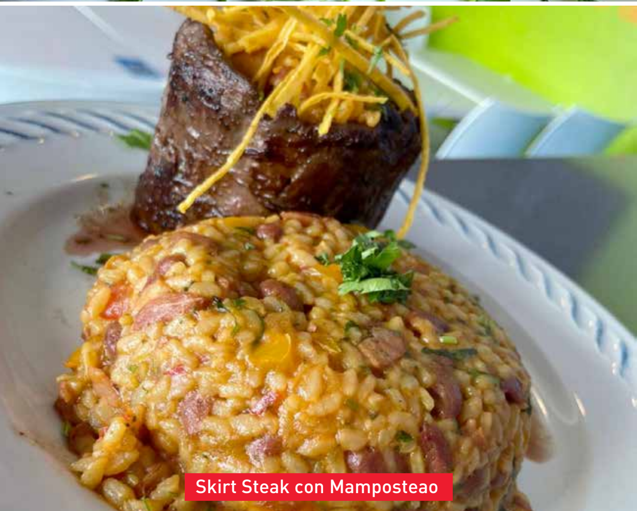
Skirt Steak con Mamposteano