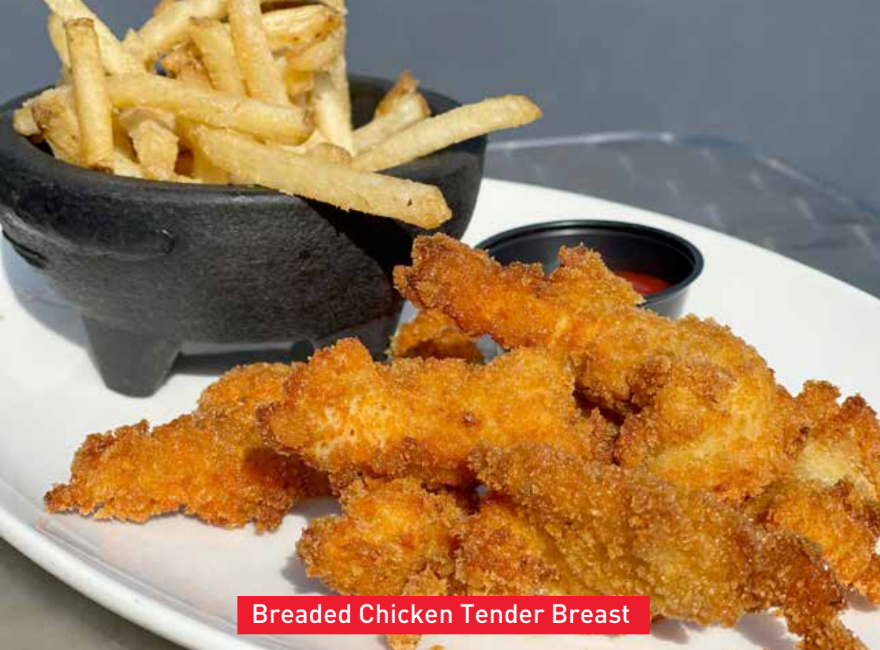
Breaded Chicken Tender Breast